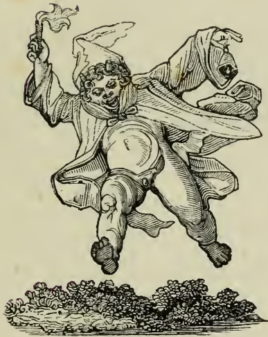
Alter et Idem.

PUBLICATIONS OF THE FOLK-LORE SOCIETY. 1888. XXIII.